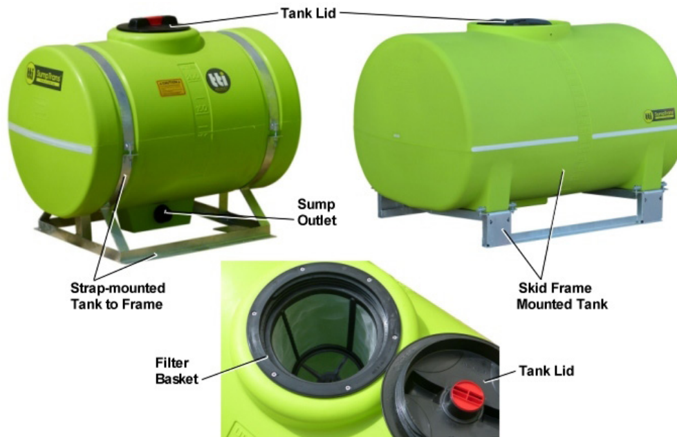
Figure 1 – Component Identification

The TTI SumpTrans ™ is designed to carry water and other fluids safely and effectively. Refer to the TTI Compatibility Chart for suitability of fluids to be carried or stored. The SumpTrans ™ has the following features, refer to Figure 1.