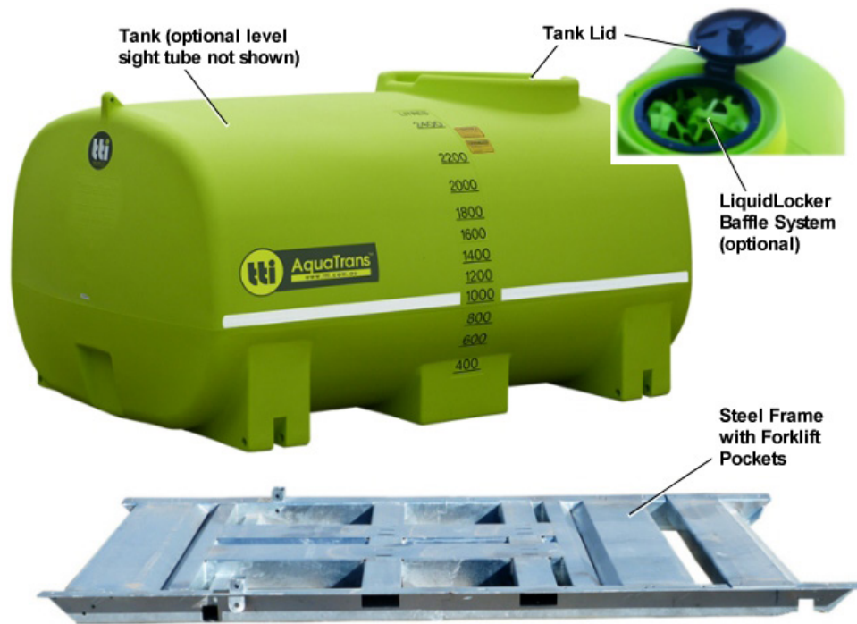
Figure 1 – Component Identification

The TTI AquaTrans & AquaMove is designed to carry water and benign fluids safely and effectively. The AquaTrans & AquaMove has the following features, refer to Figure 1.