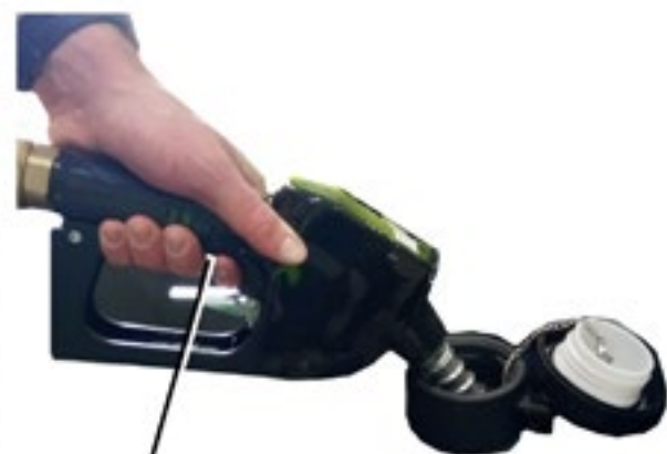
Trigger Filling Nozzle