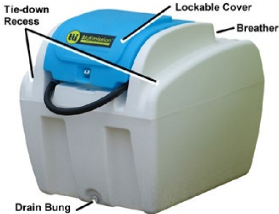
Figure 1 – Component Identification Overview (Mounting Frame not shown)