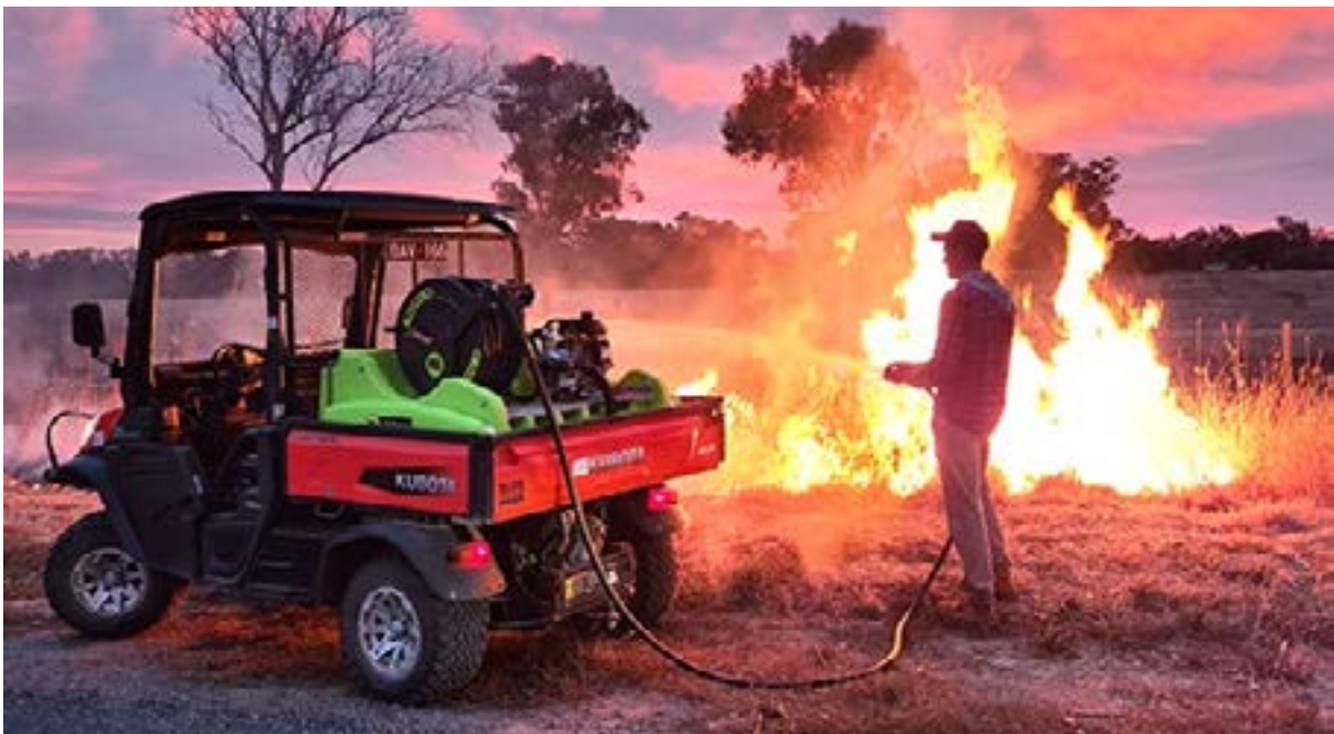
Figure 1 – FireBoss Low Profile UTV Fire Fighting Unit

Either configuration of the FireBoss is suitable for fitting to a conventional utility tray or trailer