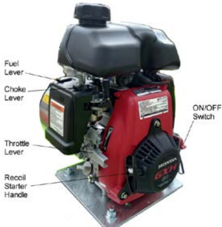
Figure 3 – Engine Start-up

If the FireBoss is not going to be used within the next few hours, shut the system down by turning the fuel tap to OFF.