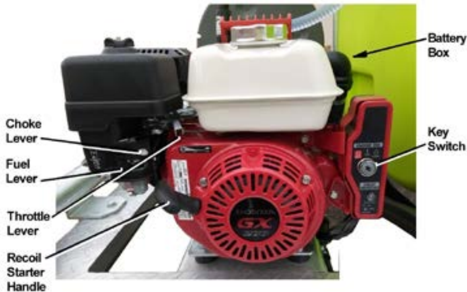
Figure 2 – Engine Start-up (Petrol Engine shown)