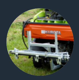
4m FlatFold Spray Boom