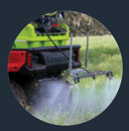
1.2m Versatile Boom with 4m Swath