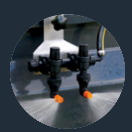
BoomTech Nozzle Kit