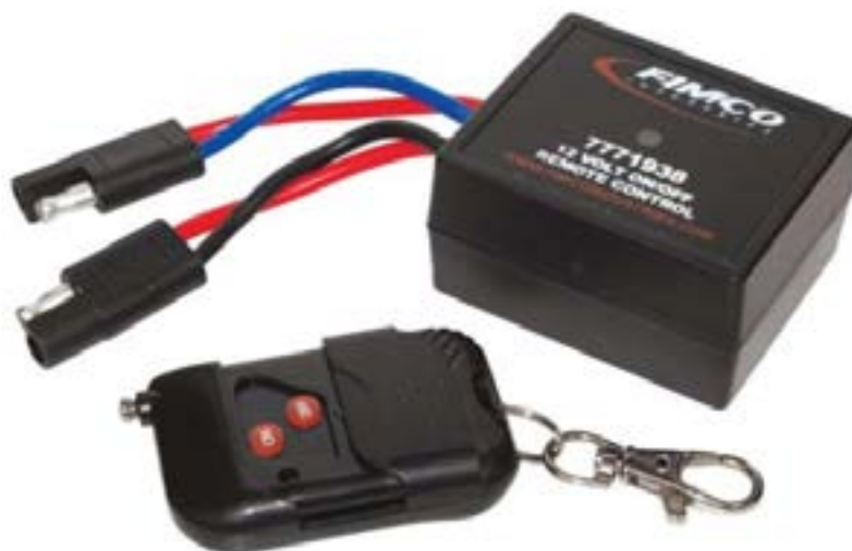
Figure 3 –ON-OFF Switch Control Unit and Wireless Remote