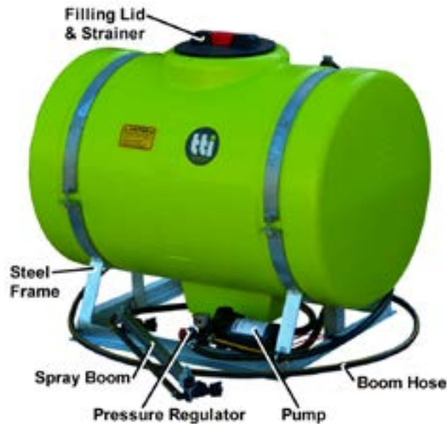
Figure 1 – Component Identification

The TTI SilageMaster Silage Applicator Unit is designed to carry and distribute inoculant using a self-contained pump and a double nozzle boom dispensing system. The SilageMaster has the features shown in Figure 1: