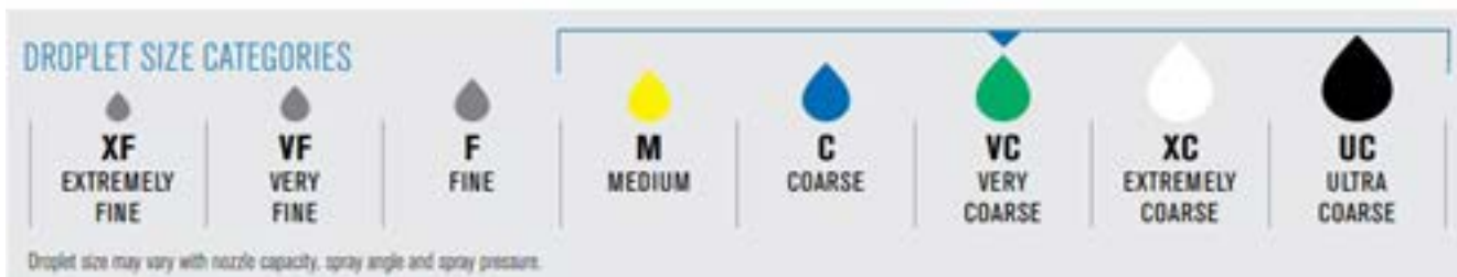
Figure 2 – AIXR Application Chart

NOTE: Always double check your application rates. Tabulations are based on spraying water at 21°C.