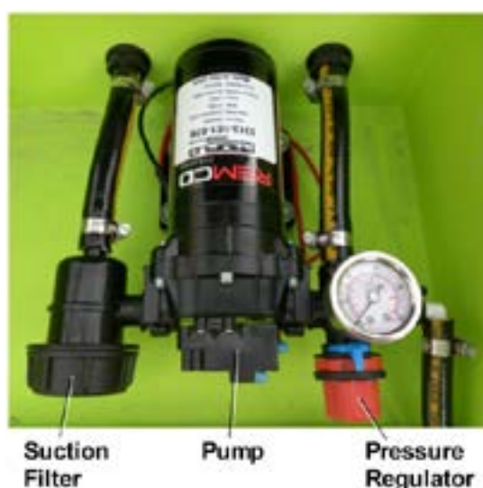
Figure 4 – Figure – Pressure Regulator