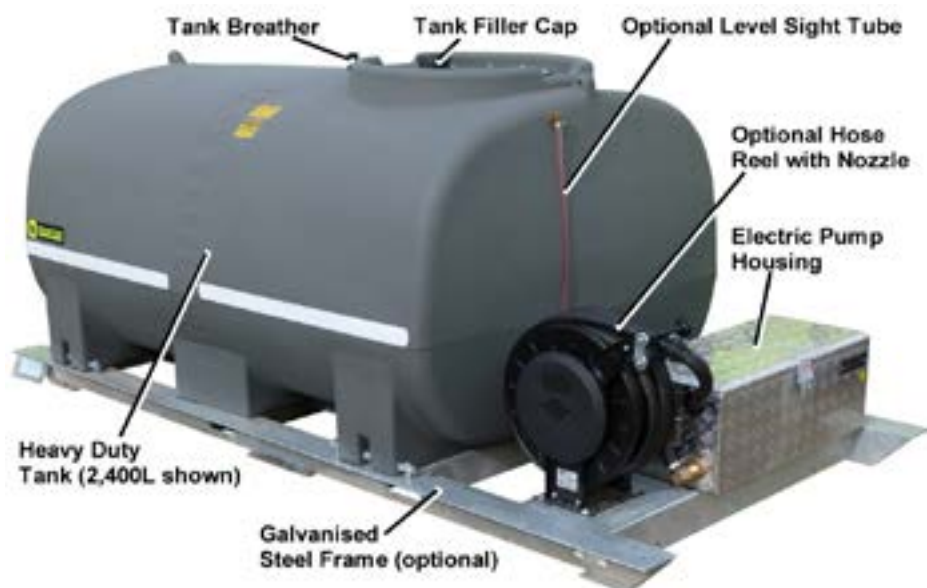
Figure 2 – Component Identification – DieselCadet with Frame and Electric Pump