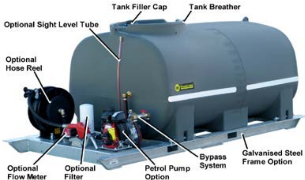
Figure 3 – Component Identification – DieselCadet with Frame and Petrol-powered Pump