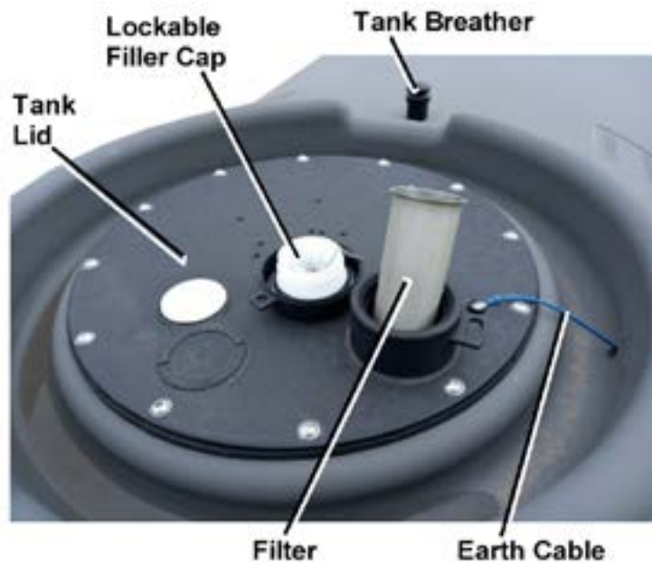
Figure 4 – Tank Filling Operation