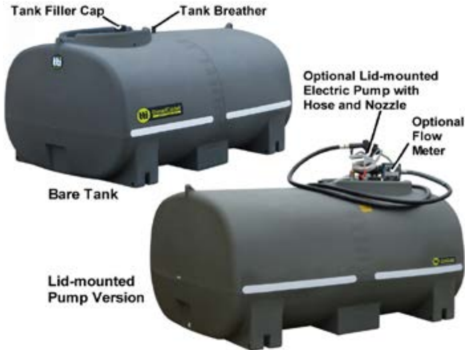
Figure 1 – Component Identification – DieselCadet (no frame versions)