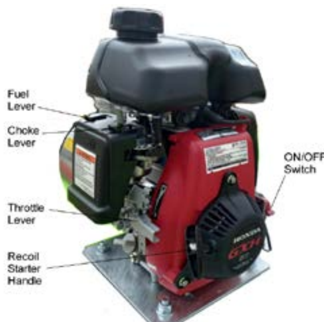
Figure 7 – Petrol Engine Start-up Procedure

If the DieselCadet is not going to be used within the next few hours, shut the system down by turning the fuel tap to OFF.