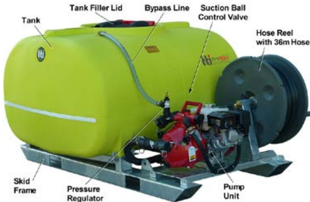
Figure 1 – Component Identification

The TTI FireAttack is designed to carry and distribute water using a self-contained pump and firefighting hose system. The FireAttack has the following features, refer to Figure 1.