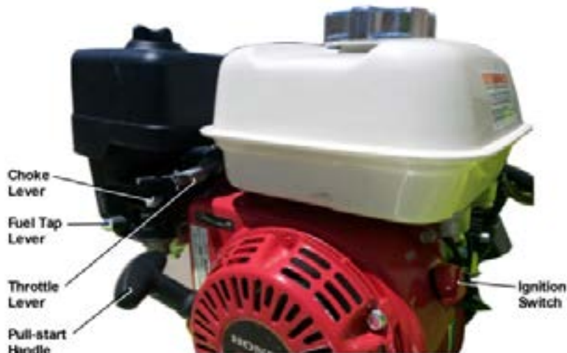
Figure 3 – Engine Start-up

If the FireAttack is not going to be used within the next few hours, shut the system down by turning the fuel tap to OFF.