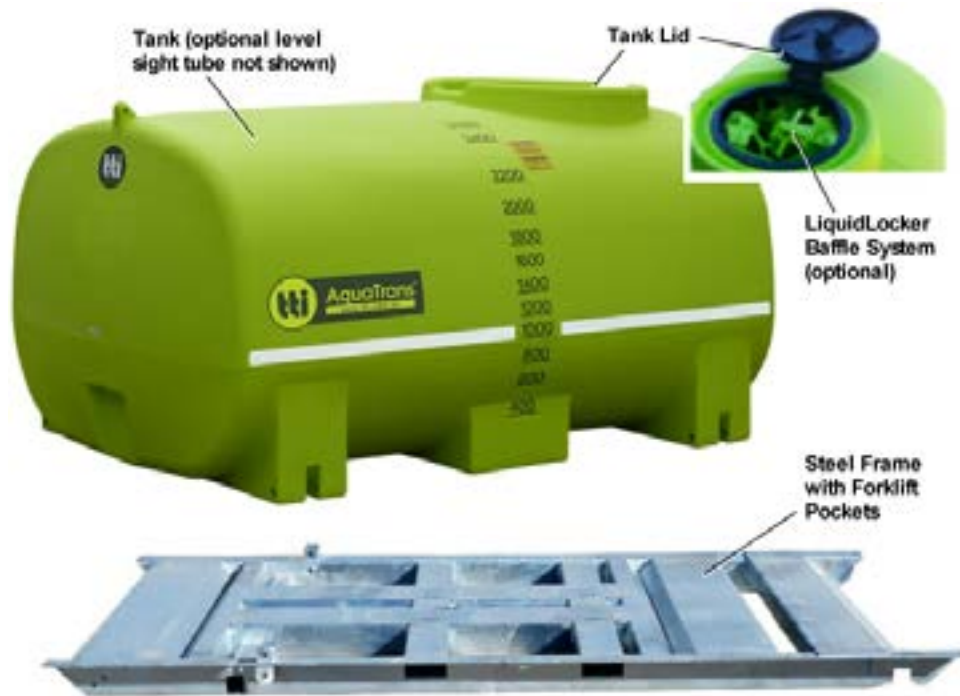
Figure 1 – Component Identification

The TTI AquaTrans & AquaMove is designed to carry water and benign fluids safely and effectively. The AquaTrans & AquaMove has the following features, refer to Figure 1.