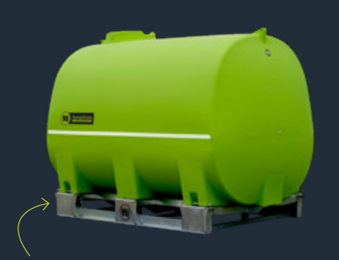
All SumpTrans™ Spray Tanks Require a Supporting Frame, Allowing for Sump Drainage